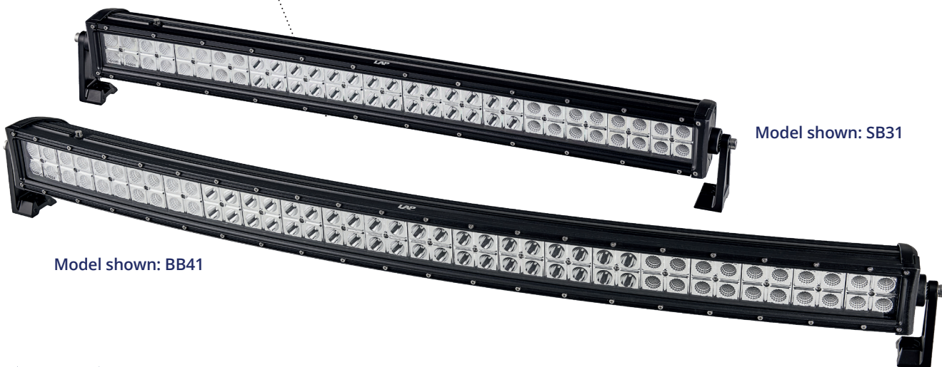
Model shown: SB31