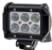
Model shown: SB04

Our range of straight and curved LED work light bars are manufactured with ultra-bright 3W LEDs giving an impressive working light that can be angled to your exact requirement. Available in 6 different lengths, the SB & BB work light bars provide a large, well illuminated working area.