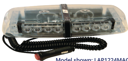
Model shown: LAP1224MAG